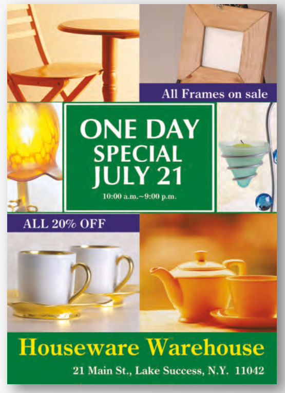
Created in PosterArtist