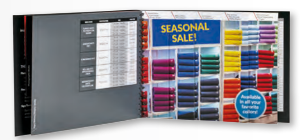
imagePROGRAF Specialty Media Swatch Book

For more information on Canon Media, please visit the Canon Consumables Web site at usa.canon.com/consumables/media.