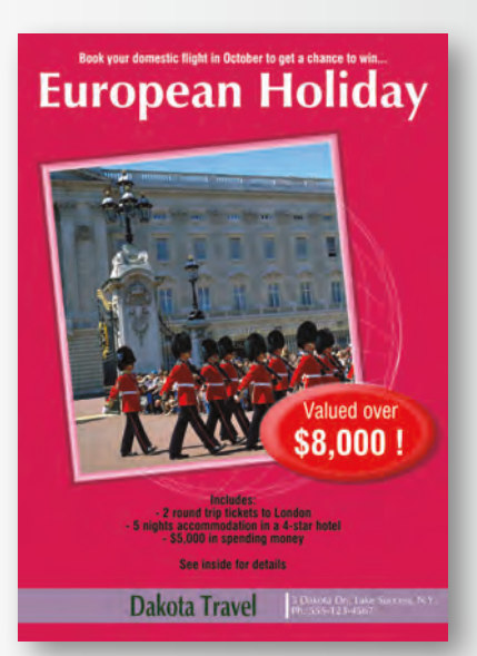
Created in PosterArtist